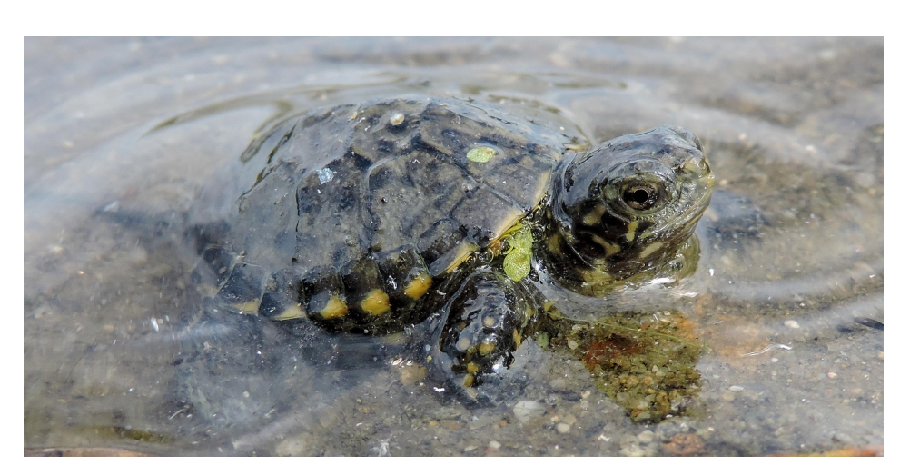
Western Pond Turtle Hatchling

Western pond turtles live in marshes, streams, rivers, ponds, and lakes, spending most of their time in water. They are omnivorous, eating insects, crayfish and other aquatic invertebrates. Sometimes they eat fish, tadpoles, frogs, carrion, algae, and other plants.