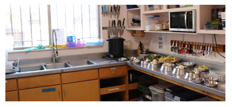
The Kitchen Counter and Sink Daily food prep.