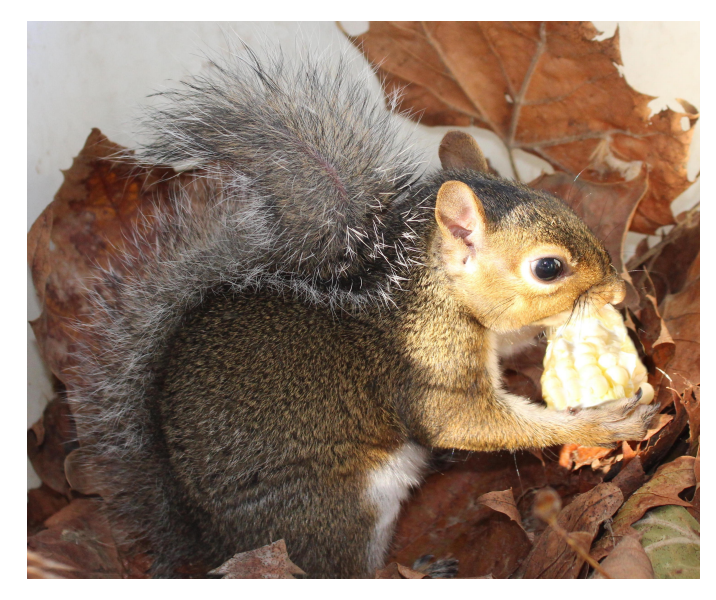
Young Eastern Grey Squirrel The face and feet will become a brighter orangish-red as he gets older.