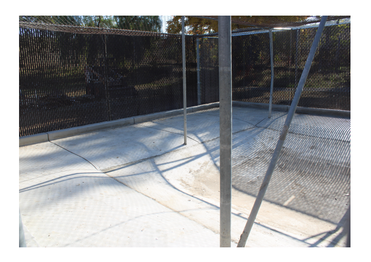
Almost Finished The filtering system still needs to be installed.