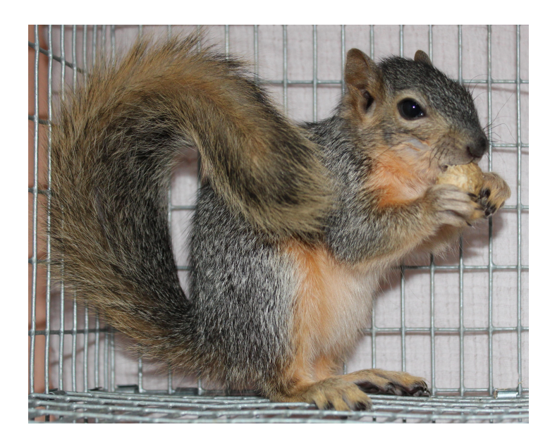
Young Eastern Fox Squirrel. His tail and belly will get redder as he gets older.

Eastern grey squirrels ( Sciurus carolinensis ) are the smallest of the three. They have brownish gray backs and tails with white bellies and a reddish strip along their sides. Their tails may have a bit of red in them. They are native to the Eastern US but have been introduced to every state, Great Britton, Australia, and many other parts of the world. They also come in black.