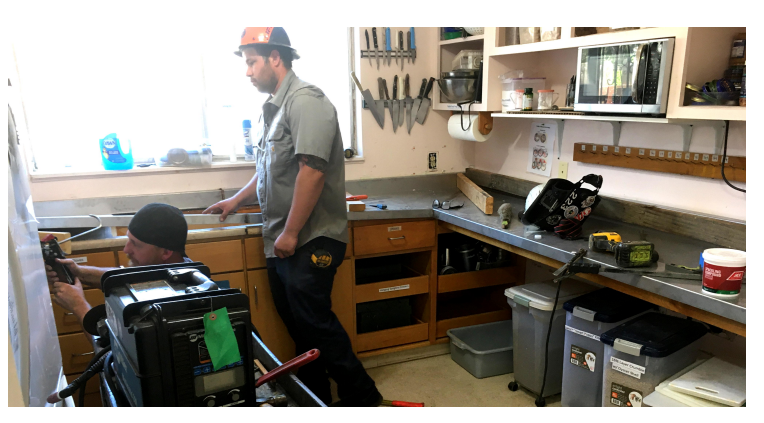
Installing the Kitchen Counters