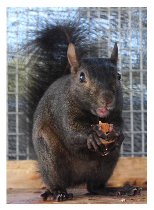
Young Eastern Grey Squirrel - Black Phase A few of the black squirrels are totally black,