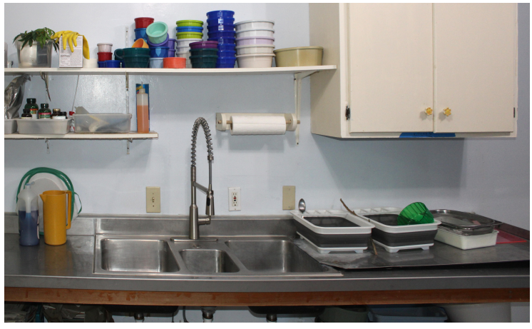
The Baby Bird Room Counter and Sink

Because they got so much use, the old Formica counters needed to be replaced every few years. The stainless counters should last as long as the building holds up. And they are easier to clean.