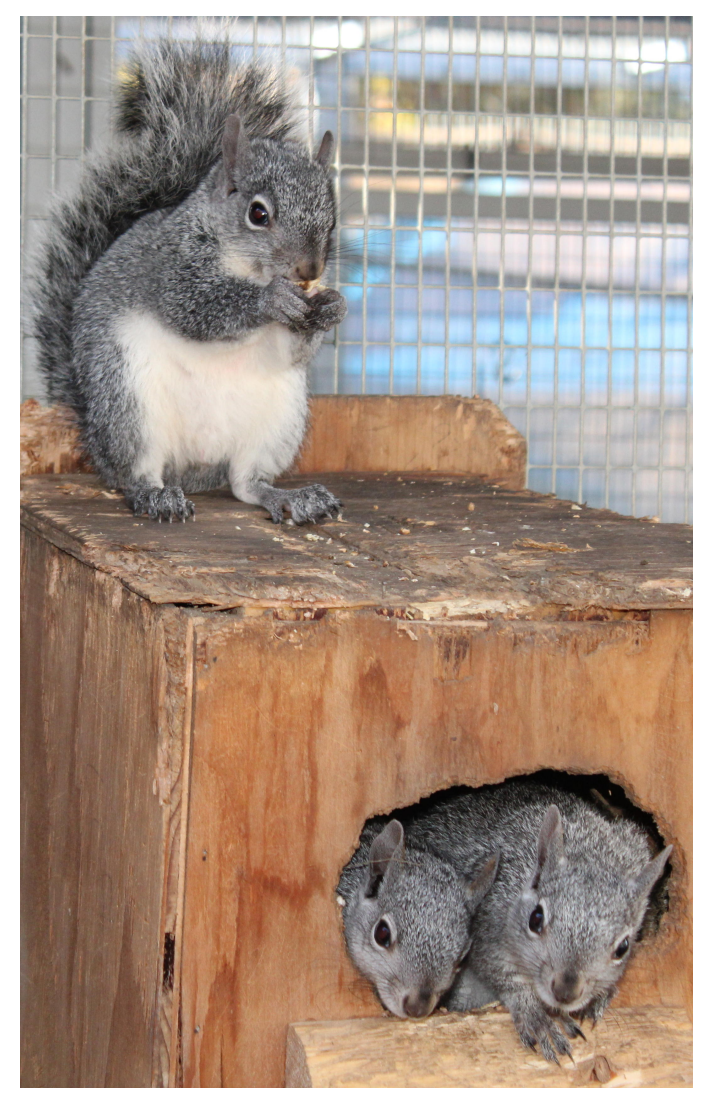
Young Western Grey Squirrels

Western gray squirrels ( Sciurus griseus ) have gray backs and tails and white bellies. They don't have any red or brown fur. They are the largest squirrel in California. Competition with Eastern gray and Eastern Fox squirrels has caused their population to decline.