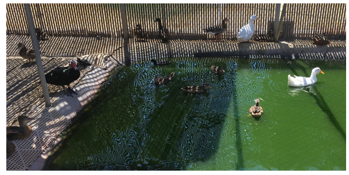
Pond Before Renovations

If we get another outbreak, we can remove the ducks and water, clean and disinfect the entire area, and replace the ducks within a few days.