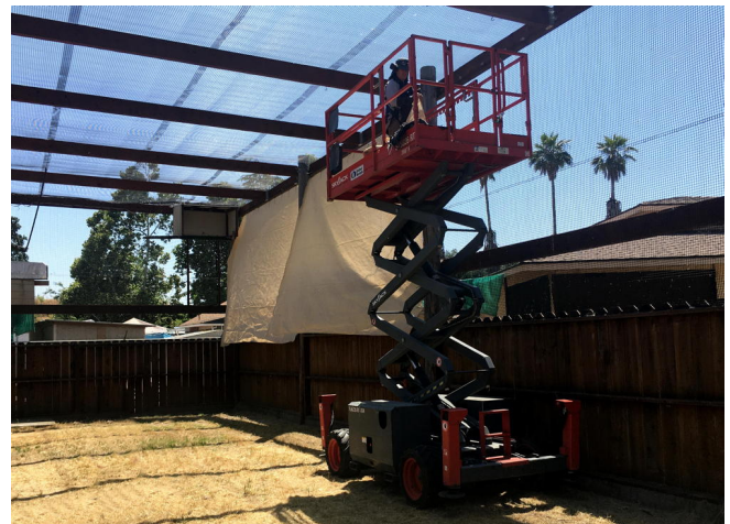
Hector on the scissor lift putting up the shade cloth. This makes it hard for people driving by to see inside the aviary. It also makes it hard for the birds to be disturbed by passersby.

We knew the netting would need to be replaced soon, but the stormy winter made the repairs imperative.