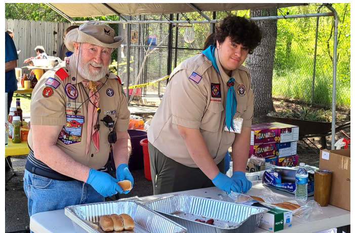
Boy Scout Troop 27 Volunteers