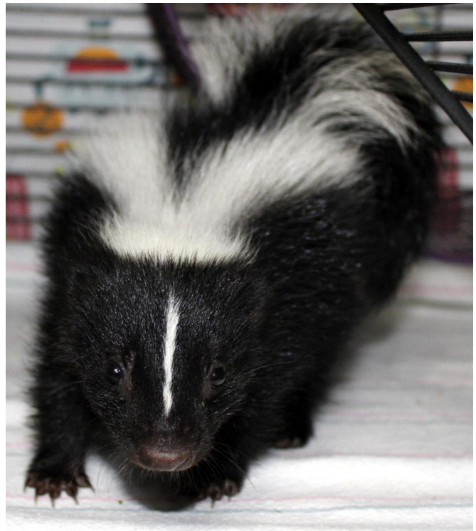
Young Striped Skunk

Most predators leave skunks alone, but hawks and owls will eat them. They are most vulnerable to great-horned owls. Great-horned owls are big enough to easily take a skunk and hunt at night when the skunks are active.