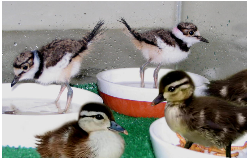
Killdeer & Wood Ducks in Incubator

Wood ducks ( Aix sponsa ) breed along the west coast and in southern states where there are large trees near water. They eat insects, seeds, and nuts. Unlike mallards, pintails, and other more common ducks, wood ducks perch in trees. After their eggs hatch, the babies jump out, bounce on the ground, and follow mama to water, where they hide along the streamside in dense vegetation. Wood ducks seldom venture into large areas of open water.