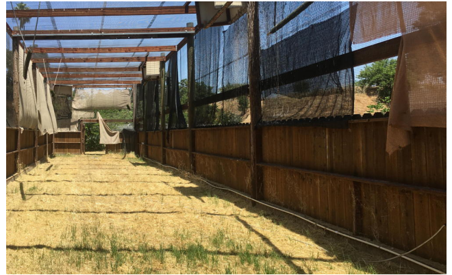
The eagle aviary before repairs. Although the basic structure is quite sound, the netting made it look as if it was about to fall down.