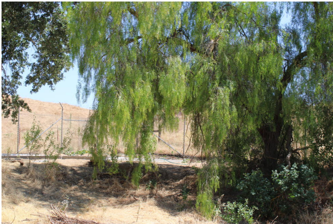
Dove Aviary Location