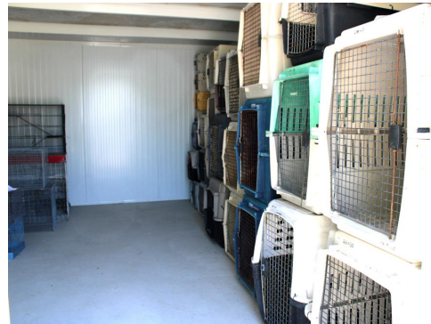
Our Carriers - we have plenty for now.