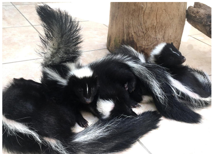
Ready for Release