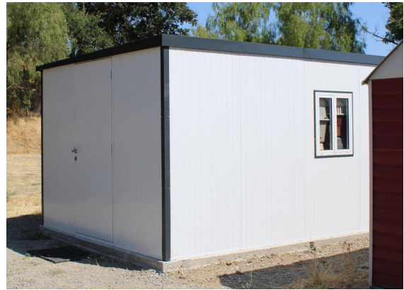
The Carrier Shed