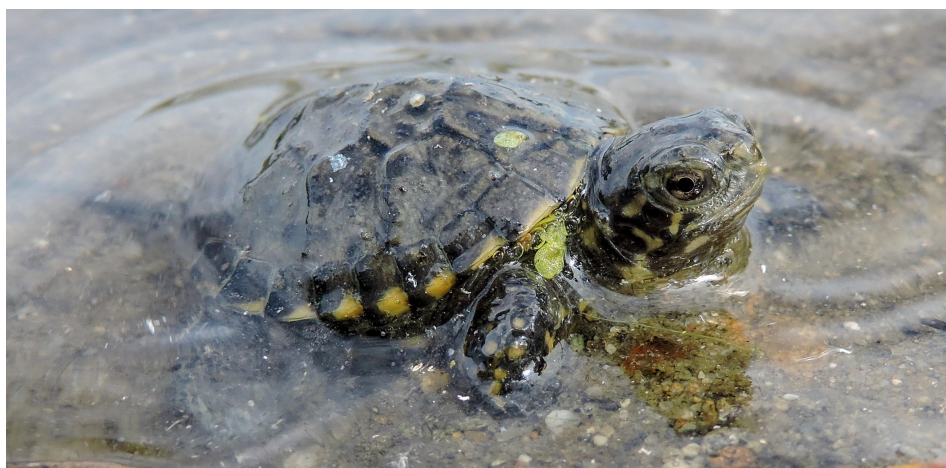
Western Pond Turtle Hatchling

Western pond turtles live in marshes, streams, rivers, ponds, and lakes, spending most of their time in water. They are omnivorous, eating insects, crayfish and other aquatic invertebrates. Sometimes they eat fish, tadpoles, frogs, carrion, algae, and other plants.