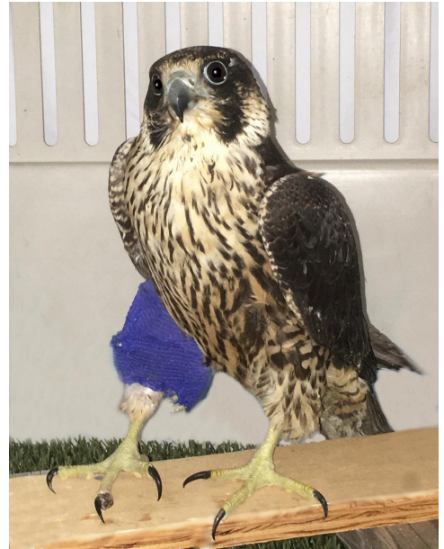
The pins and bandage made it awkward for her to stand. She is still in first-year plumage

By the time you read this, she should be in the eagle aviary getting strong enough for release.