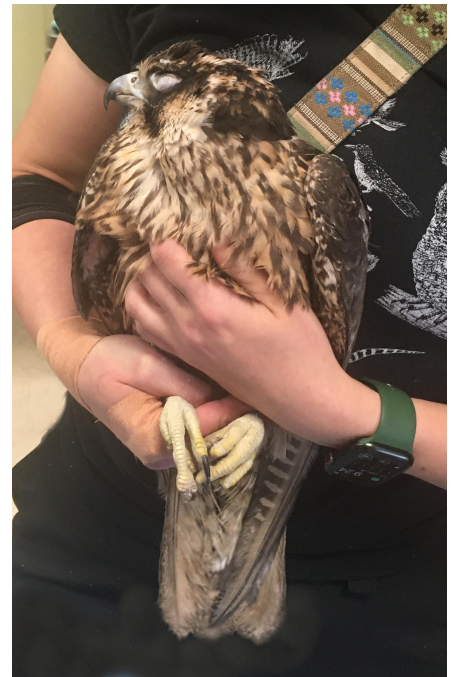
Waking up after removing the pins.