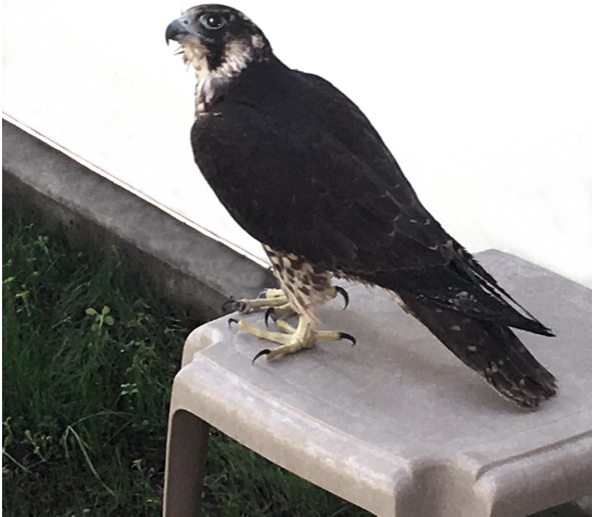
Finally, in an outside aviary.