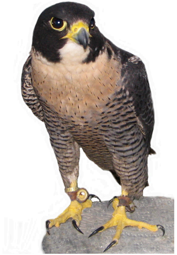
What she will look like after she molts into adult feathers this spring.