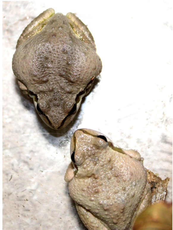
Both tree frogs are very well fed.