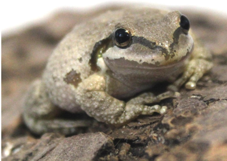
Sierran Tree Frog