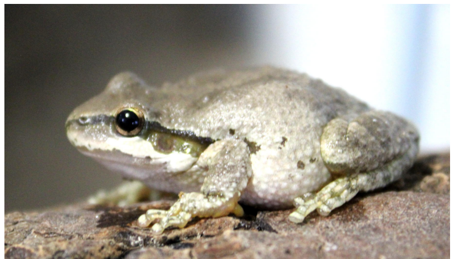
Sierran Tree Frog