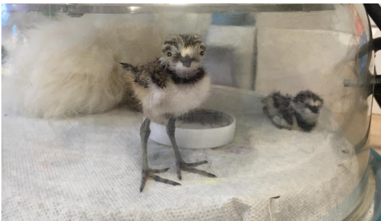
Newly Hatched Killdeer