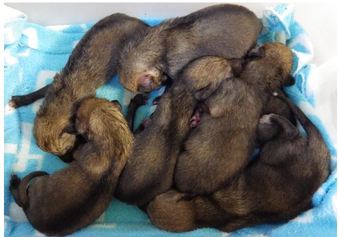
Three Day Old Coyotes